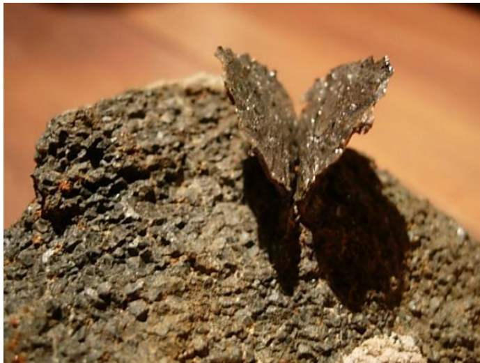
Graphite butterfly, in a slightly weathered Hornblende matrix – Glenn carefully removed the matrix to expose the Graphite.