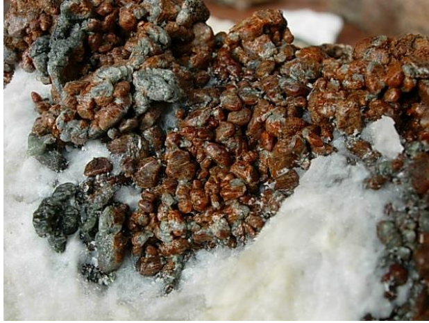
Some of the Chondroditites are half green!