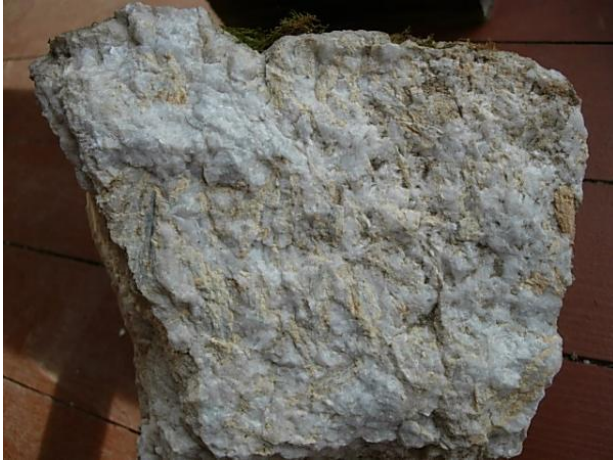
Some pictures of the Tremolite- Norbergite without UV.