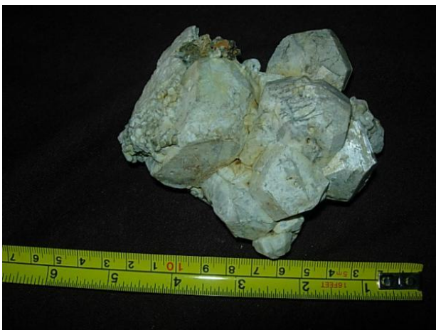
This Scapolite (Meionite) cleaned up really well.