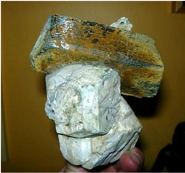
Super iron out makes all the difference. 20 minutes in the ultrasonic cleaner.