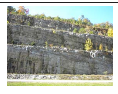
Both limbs of the Hanging rock anticline.

The stop at Baker Quarry showed a large wall of Silurian/Devonian age mud cracks that had undergone lithification then been tilted to almost vertical.