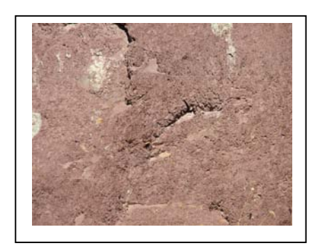
Sand channels and "root casts"

Another stop showed Devonian age delta environment where evidence of plant roots and other organic material had been preserved and sand channels had been cut in the shale.