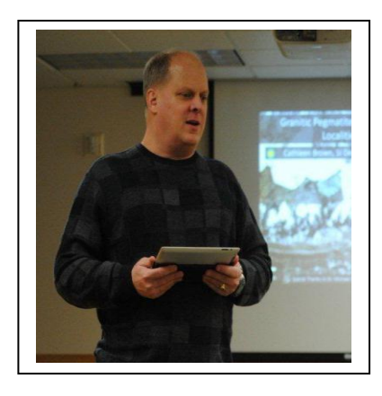
THE PREZ SAYS...