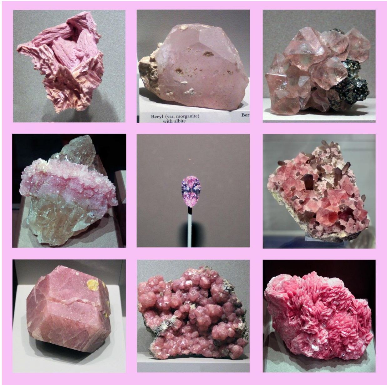
Starting at the top left: dolomite cast, morganite (related to aquamarine), pink fluorite with pyrite, rose quartz, pink diamond (rarest of the rare), pink fluorite from France, pink garnet from Mexico, pink smithsonite, pink rhodonite.

I was initially asked to do this by a new friend, but it has more meaning to me. My maternal grandmother got breast cancer years ago. She survived it and much later passed on due to unrelated causes. One of my maternal aunts got the same