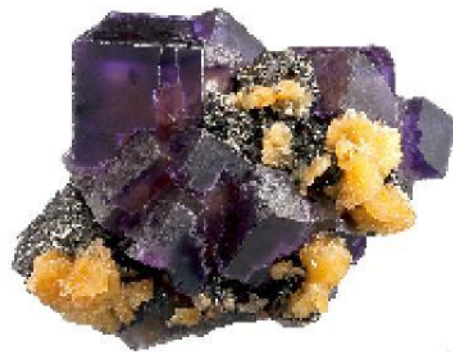
Fluorite, Barite & Sphalerite Denton Mine, Hardin Co. IL