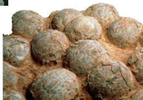
Dinosaur eggs - China