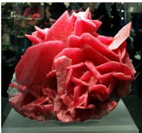
The “Empress of China” Rhodochrosite Wudong Mine, Wuzhou Guangxi Zhuang, China

Unlike minerals, fossils are the preserved remains of plants and ani-